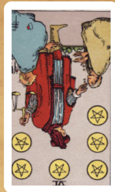
| Tarot illustrations by Pamela Colman Smith